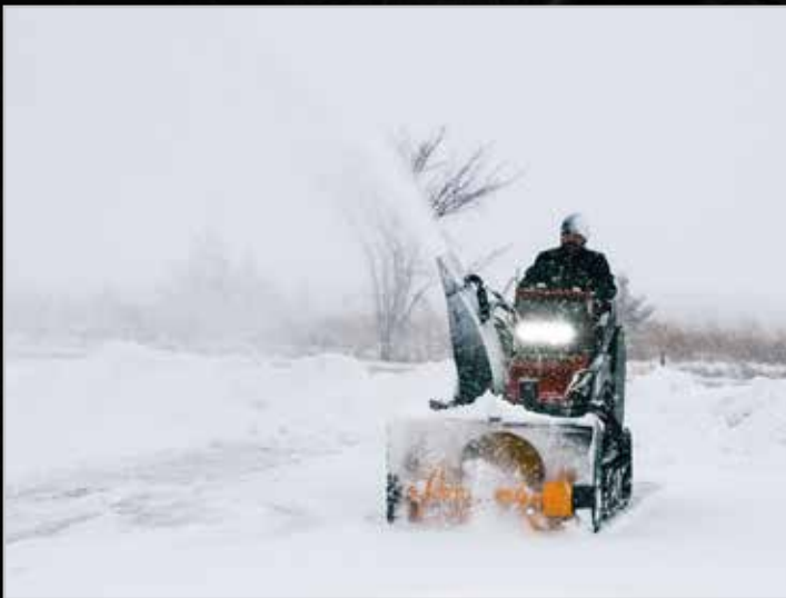
Casts snow up to 25' away