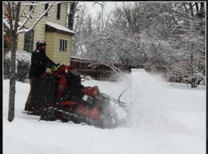
Hydraulic chute rotation allows choice of casting direction