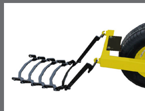
Drag Chain Optional