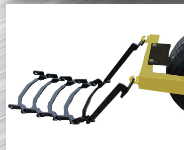
Drag Chain Optional