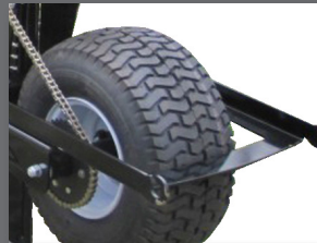
Tire Scraper Optional