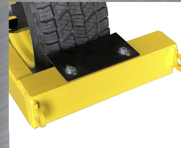
Tire Scraper Standard