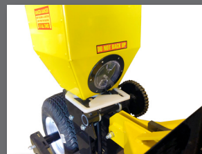
Removable Sight Glass