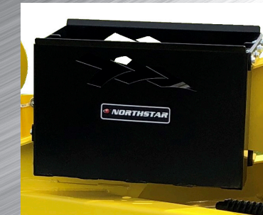
Weight Box Standard