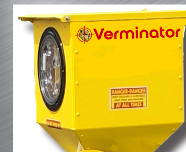
Large Removable Sight Glass