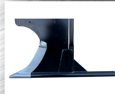
HD Parabolic Shank w/ Hardened Alloy Point