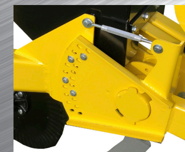
Eze-Adjust Turnbuckle System